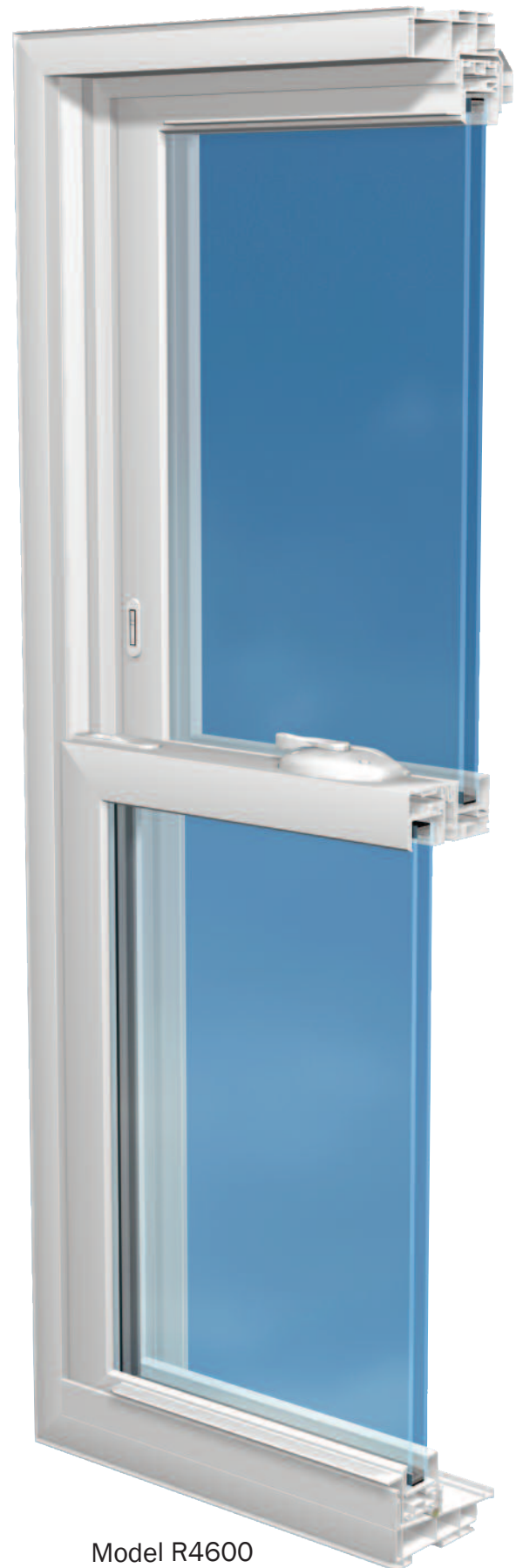
Model R4600 Double Hung

Concealed stop system. Sash stops are concealed, leaving the window jamb interior uncluttered and uninterrupted.